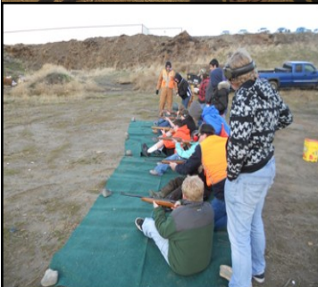
Students shooting .22 rifles on field day.

coming up. As usual we will host some "Last Chance Summer Dance" classes before the end of September.